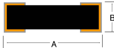
TABLE I. DIMENSIONS: