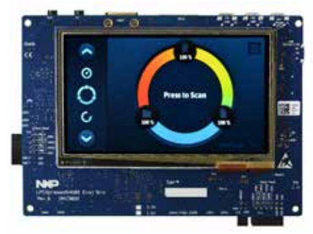
LPCXpresso54608 (OM13092) Development Board