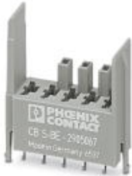
Solder base element for PCB mounting for accommodating CB TM... or CB E... device circuit breakers

Please be informed that the data shown in this PDF Document is generated from our Online Catalog. Please find the complete data in the user's documentation. Our General Terms of Use for Downloads are valid ( http://phoenixcontact.com/download )