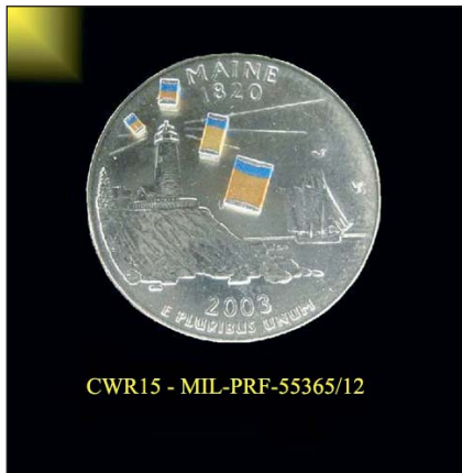
CWR15 - MIL-PRF-55365/12

AVX announces the world's smallest military approved tantalum chip capacitors. The CWR15 offers 0603, 0805 and 1206 case sizes in capacitance/voltage combinations previously only available in much larger packages. The revolutionary AVX TACmicrochip® technology offers designers significant